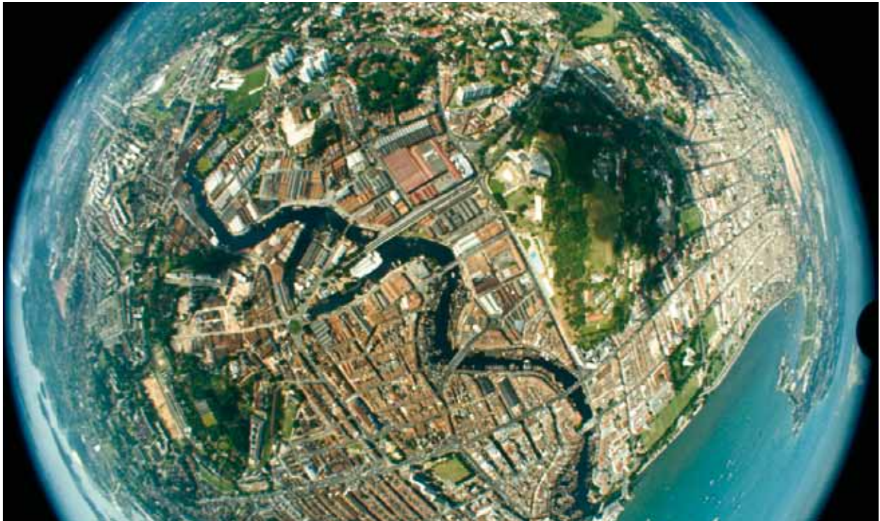
A fisheye lens can offer a chance to make unusual images.

a standard lens. This effect can be used to “drop out” or blur backgrounds to create a sharp, clear subject without the confusion of a busy background.